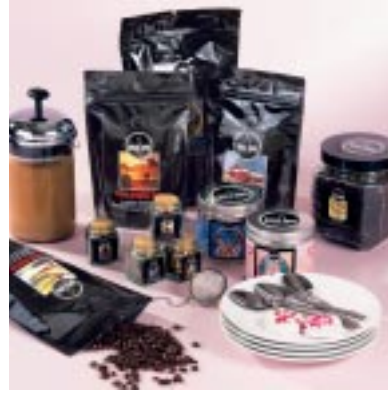
Boca Java™ brand gourmet coffee, tea, hot cocoa and chocolate covered cookies

BLYTH'S MISSION TO REACH CONSUMERS directly is achieved through its implementation of a multi-channel product distribution strategy. Expanding upon its foundation in the direct selling and wholesale markets, Blyth entered the direct-to-consumer Catalog & Internet channel with the strategic acquisitions of the Miles Kimball Company and Walter Drake in 2003. Today, through its integrated Miles Kimball Company division, Blyth is a top 100 U.S. catalog retailer, generating nearly $200 million in sales in fiscal year 2006. The Miles Kimball Company now markets five direct-to-consumer Catalog & Internet brands. The flagship Miles Kimball® brand offers distinctive seasonal, value-priced gifts, personalized merchandise and household convenience items. The Walter Drake® brand features unique functional items for everyday home use, as well as personal care products and specialty, personalized paper goods. Both the Miles Kimball and Walter Drake brands offer a wide range of personalized Christmas cards. Premium photo, display and memory-keeping products are the hallmark of the Exposures® brand. The Home Marketplace® brand offers high-quality home, kitchen and outdoor products at great values. In 2005, the Easy Comforts™ title was launched, updating and expanding the Company's line of specialty personal care products for senior living.