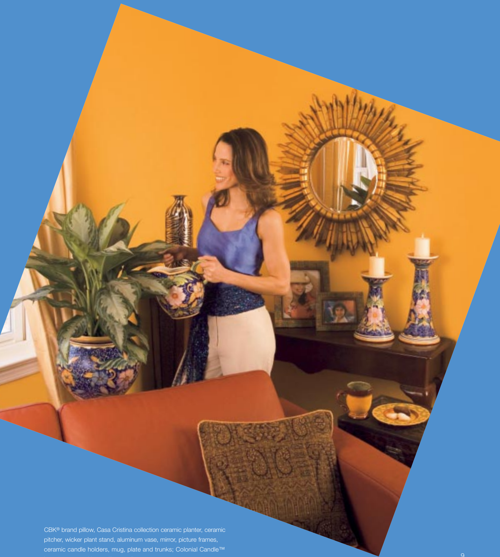
CBK® brand pillow, Casa Cristina collection ceramic planter, ceramic pitcher, wicker plant stand, aluminum vase, mirror, picture frames, ceramic candle holders, mug, plate and trunks; Colonial Candle™ brand unscented ivory pillar candles